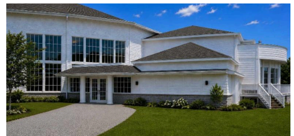
After Upgrades – (Rendering)