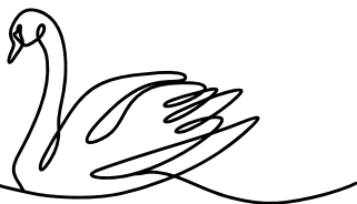
Jackie Dingus LJ Swan Keeper

We continue to need additional volunteer help in various areas of caring for the swans, including daily feedings. If you would be interested, please contact me at jgdingus@charter.net